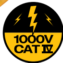
Fluke 1AC II